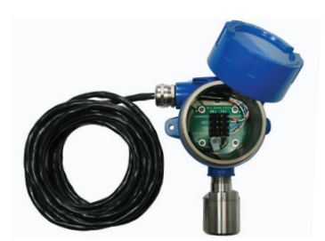
Shown with 10-0247 stainless steel sensor head

The 10-0411 Remote Sensor Kit allows smart sensors to be mounted up to 15 feet away from the SenSmart 7000 . SenSmart 7000 s may be configured as single or dual sensor monitors so either one or two 10-0411 Remote Sensor kits may be connected to each SenSmart 7000 . When combined with the 10-0247 Stainless Steel sensor head, the 10-0411 is suitable for Division 1 hazardous locations.