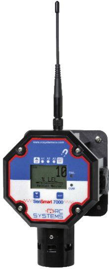
Non-metallic Poly "PY" model

"The Art of Gas Detection" - Built with our Proven WaveCast Transmitter