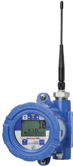
Aluminum "AL" XP model