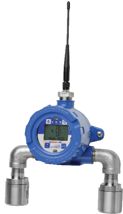
Aluminum "AL" model with Dual Sensor

The battery -powered SenSmart 7000 wireless gas detector, with ultra-low power design and easy to use features, provides the most advanced, economical and reliable true wireless toxic and combustible gas detection solution. The SenSmart 7000 is compatible with all RC System's toxic sensors, including hydrogen sulfide, carbon dioxide, oxygen, hydrogen cyanide and many others. In addition, the SenSmart 7000 also supports the new low-power infrared sensor for hydrocarbon combustibles or carbon dioxide.