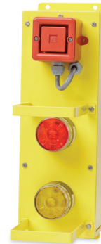
Two Light Alarm Bar With Horn