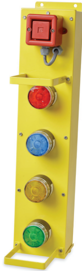
Four Light Alarm Bar With Horn