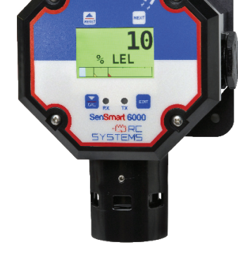
Aluminum "AL" XP model