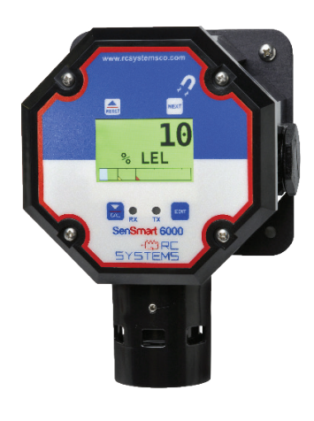
Non-metallic Poly "PY" model

The State-of-the-art SenSmart 6000 gas detector is built with our proven 'ST-44' transmitter. This versatile unit has a bright, vivid color display and embedded Ethernet with Webserver and Modbus TCP. The high performance, universal gas detector supports dual smart sensors with different type like Electrochemical, Catalytic Bead, Infrared and Photoionization sensors.