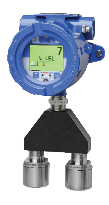
Aluminum "AL" XP model wtih Dual Sensor

The State-of-the-art SenSmart 6000 gas detector is built with our proven 'ST-44' transmitter. This versatile unit has a bright, vivid color display and embedded Ethernet with Webserver and Modbus TCP. The high performance, universal gas detector supports dual smart sensors with different type like Electrochemical, Catalytic Bead, Infrared and Photoionization sensors.